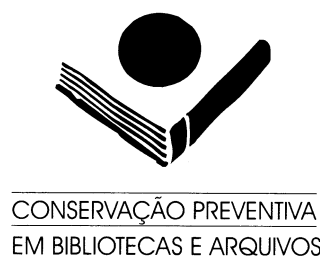
Fig. 3. Project logo

Distribution. Upon publication, complete sets of the translations were sent to each of the 160 participants registered for the six core workshops held between May and September, for use as personal study material. An additional 1,332 sets were distributed between September and November 1997 to institutions registered in the survey database by then. These included 147 sets sent to the organizers of regional workshops who then distributed the documents to workshop participants.