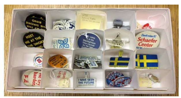
Rehoused objects at Queens Museum

Another challenge of the project was scouring both Museums' collections for all World's Fair materials. This involved searching both Museums' content management systems, physically surveying spaces, consulting legacy documentation, and harvesting institutional knowledge from staff. At MCNY World's Fair materials located in other artificial manuscript collections (such as the Pamphlet Collection) were removed and physically integrated into the World's Fair boxes. However, items found in the Decorative Arts; Costumes and Textiles; Photographs, Drawings, and Prints; and Theater collections were intellectually described in the finding aids while continuing to "live" in their respective departments. At QM we had to inventory items stored off-site and in the Visible Storage Gallery. It seemed that every couple of months new boxes and materials would show up, unearthed from various nooks and crannies of the Queens Museum. While some of the items we located at each museum had already been cataloged (or at MCNY, even digitized) they had never before been presented to the public as part of a unified World's Fair collection.