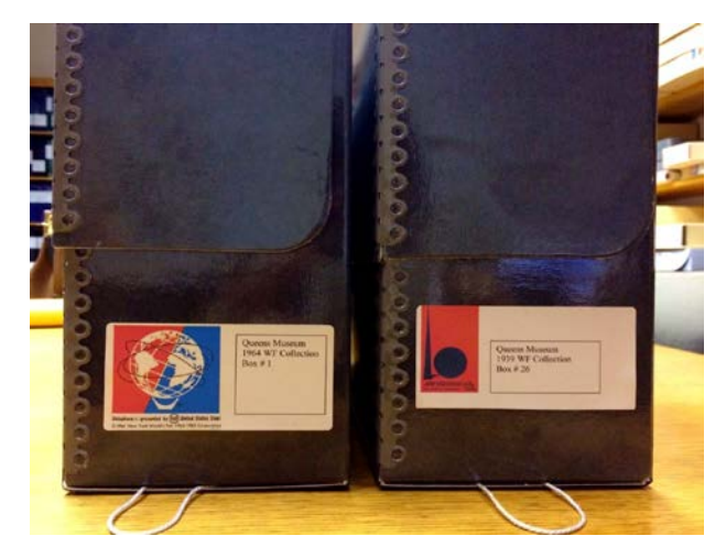
At the Queens Museum we made graphic labels so that staff could easily identify 1939 and 1964 World's Fair boxes.

Collections Tumblr: <a href="http://nyworldsfaircollections.tumblr.com/">http://nyworldsfaircollections.tumblr.com/</a> Posts on MCNY blog: <a href="http://mcnyblog.org/tag/worlds-fair/">http://mcnyblog.org/tag/worlds-fair/</a>