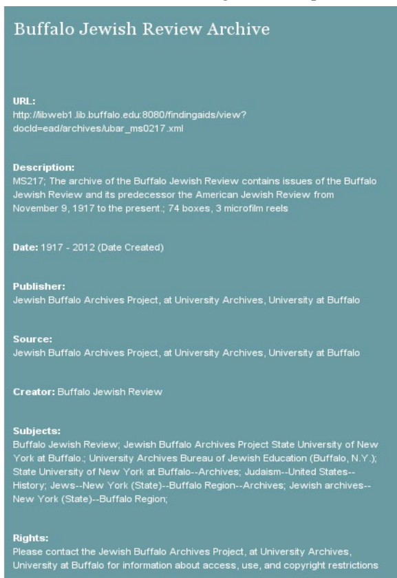
Fig. 3: Record in the Portal to American Jewish History

The Jewish Historical Society of Greater Hartford provided EAD files by e-mail. The EAD files were exported from Archivists' Toolkit, and were thus uniform in terms of tag and data placement.