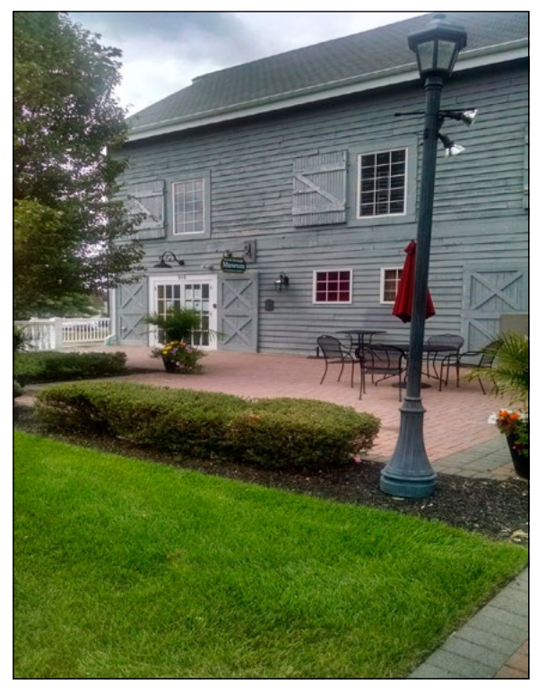
Fig. 2: Jewish Heritage Museum of Monmouth County

After establishing collaborative relationships, the initiative's next step toward increasing access to American Jewish collections was the ingestion of collection-level records into AJHS's Portal to American Jewish History. AJHS's portal is a metadata aggregator that enables researchers to perform complex searches across American Jewish archival collections currently residing at more than 10 geographically dispersed repositories. It is currently set up on a Drupal Collective Access platform. Drupal is an open source website content management system, and CollectiveAccess is an open source collection information management