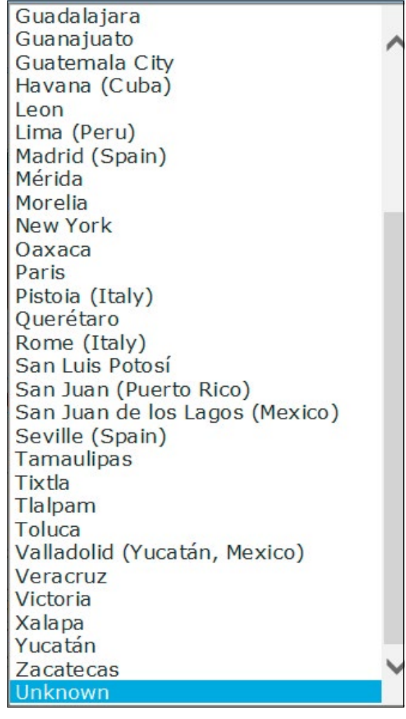
Fig. 4: Drop-down list for Publication: City field

Using feedback generated by the student's examination of the items permitted us to provide larger numbers of controlled terms. Still, this strategy is more useful when working with a more homogeneous collection such as the Primeros Libros , which is limited to sixteenth-century imprints and thus associated with a limited number