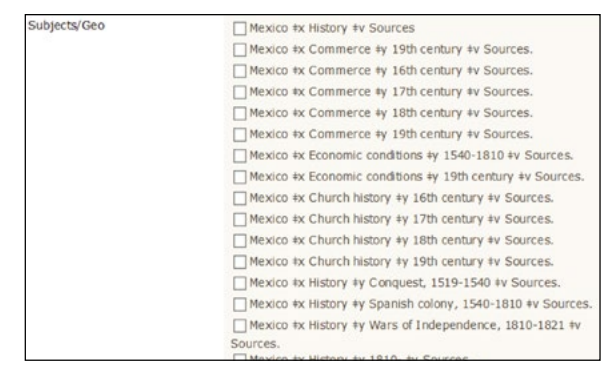
Fig. 3: Subject element with embedded list

Controlling the possible values ensures compatibility with values used in existing cataloger-produced records. In turn, this promotes indexing and faceting when the new records are integrated into the catalog. The controlled vocabulary lists also reduced typographical errors.