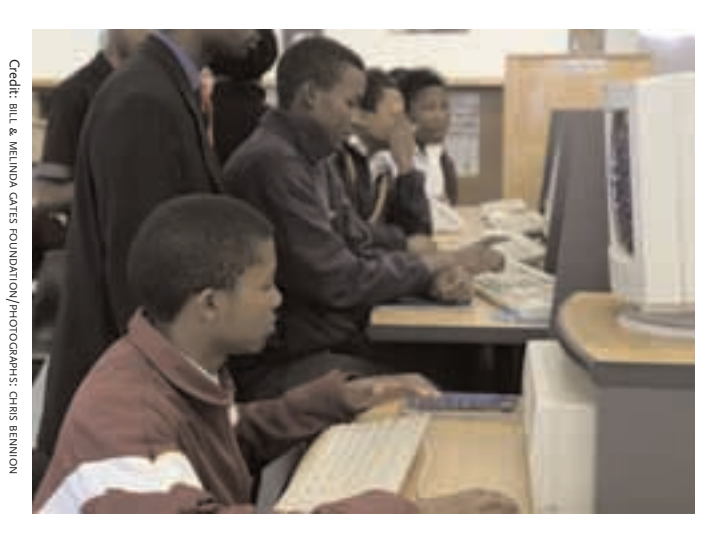
Free Internet access is critical to Smart Cape's success.

Libraries were chosen as the best locations for the project largely because they had the necessary infrastructure—secure buildings owned by provincial government and