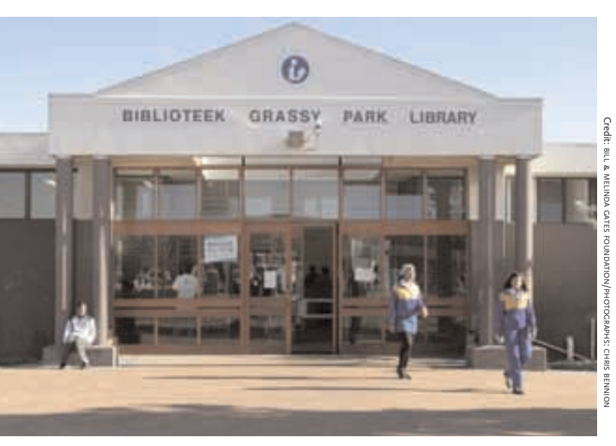
Grassy Park has the largest number of users. It is located in a working class community with a large Muslim population.

It's II:15 on a drizzly September morning when Dexter Anthony logs on to the Internet