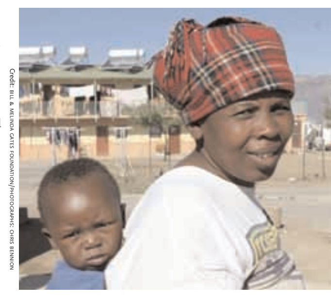
Atlantis Wesfleur designated August 2003 as "Women's Month" and arranged workshops on business opportunities for women.

Despite its foundation as a job-creation center where industry was subsidized to encourage development, Atlantis is a poor, isolated community with few support structures. Opportunities are desperately