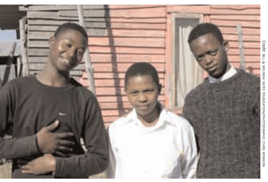
Smart Cape access points help South Africans, particularly youngsters, realize how information technology can change their lives.

Brooklyn is a suburb situated between an industrial area on the west and an air force base on the east. Under the apartheid administration, this area was reserved for working-class whites and housed many of the city's poorest residents. Today, the neighborhood is multiracial.