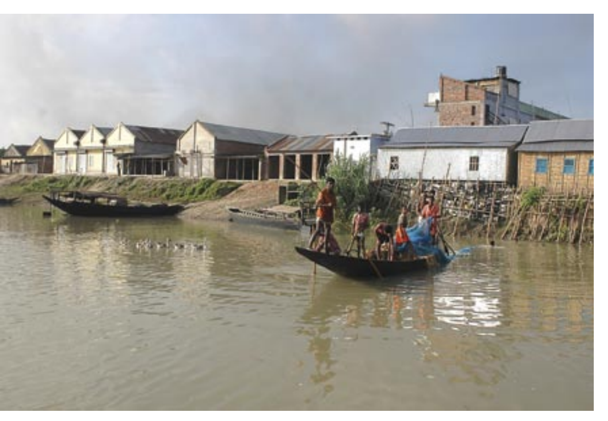
Fishermen on the river, Bildohar, Natore.

tral database that helps Shidhulai track trends in the project area.