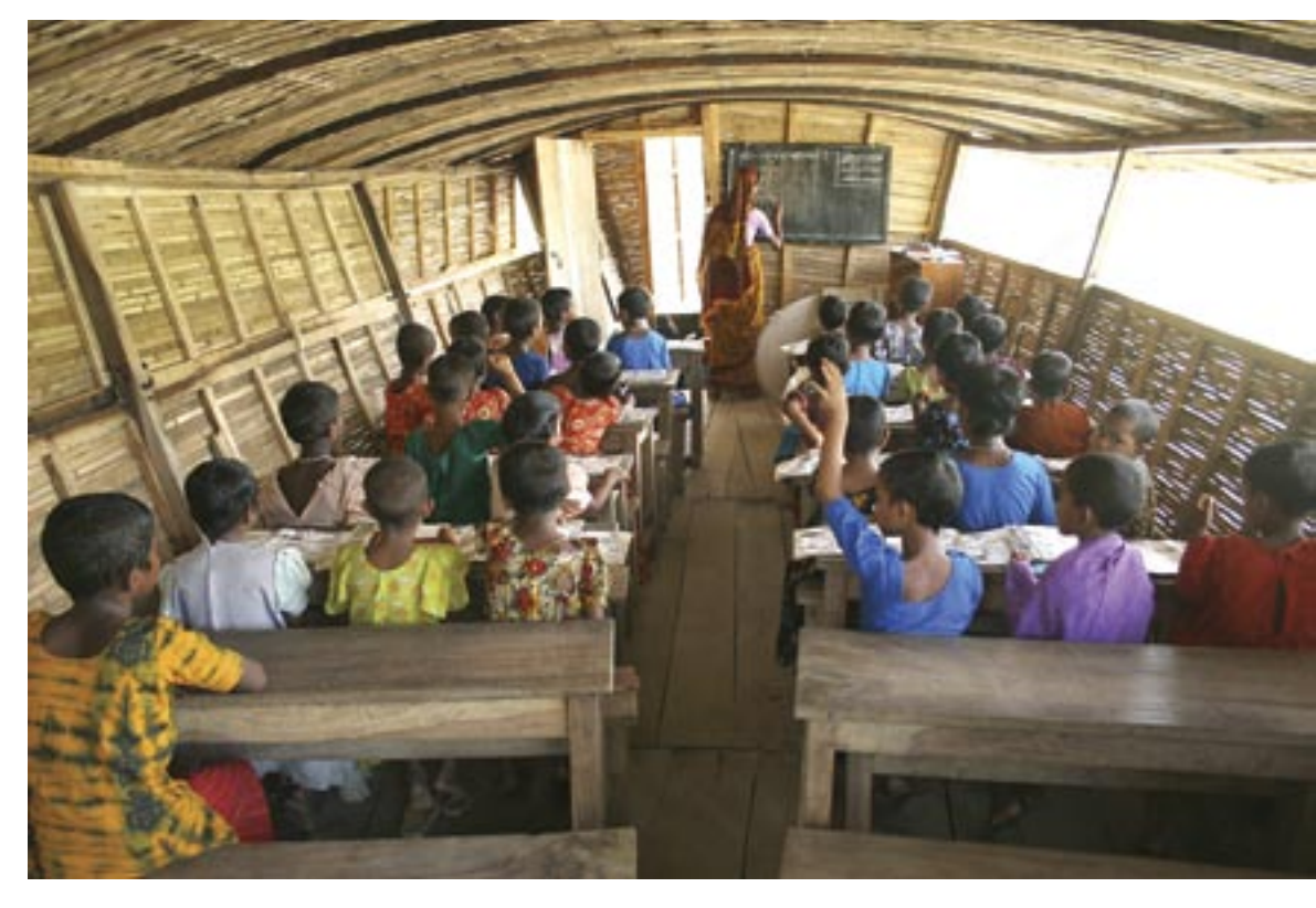
Even when roads are impassable during the monsoon, students can still attend school in the boats.