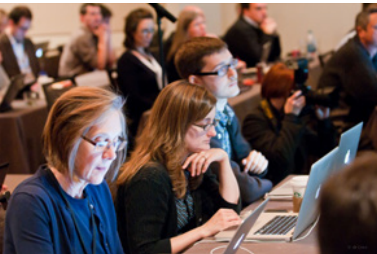
2012 DLF Forum

There is an urgent need for a reliable and increasingly sophisticated professional cohort to support data-intensive research in our colleges, universities, and research centers. Data curation activities enable data discovery and retrieval, maintain its quality, add value, and provide for reuse over time. This new field includes authentication, archiving, management, preservation, retrieval, and representation.