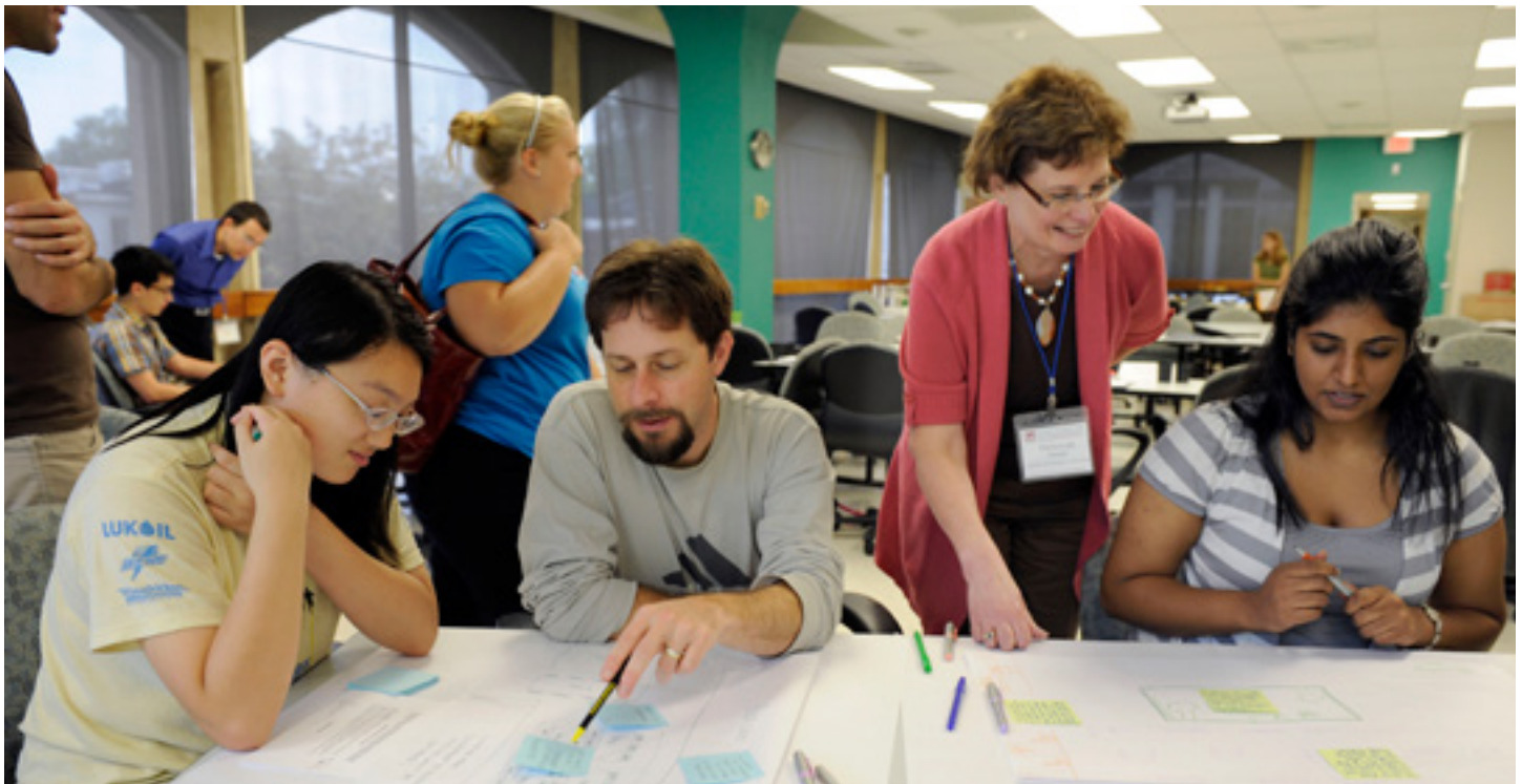
Attendees at a Participatory Design Workshop at Temple University collaborate with students on rethinking library spaces, services, and tools.