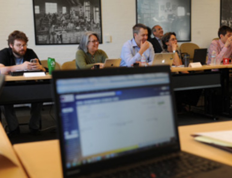
The CLIR/DLF Data Curation Fellowship will help train a new cohort of professionals to support data-intensive research.

In an effort to raise awareness and build capacity for sound data management practices throughout the academy, CLIR launched the CLIR/DLF Data Curation Fellowship Program in the spring of 2012 with support from the Alfred P. Sloan Foundation. The program provides recent Ph.D.s with professional development, education, and training opportunities in data curation for the sciences and social sciences. Later that year, with support from The Andrew W. Mellon Foundation, CLIR expanded the program to include Data Curation Fellowships in Medieval Studies.