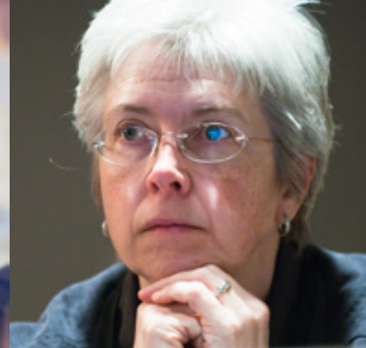
A few faces from the Leading Change Institute and DLF Forum.