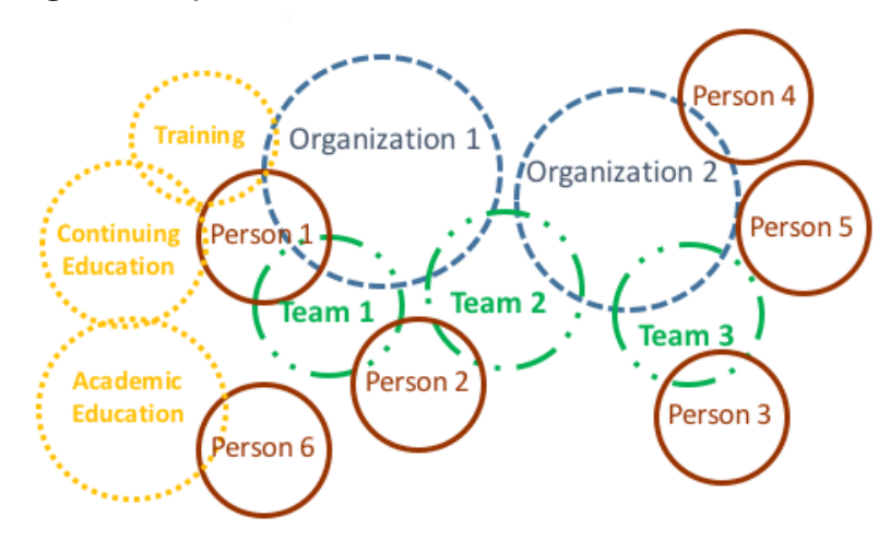
Fig. 3.1 Perspectives on skills