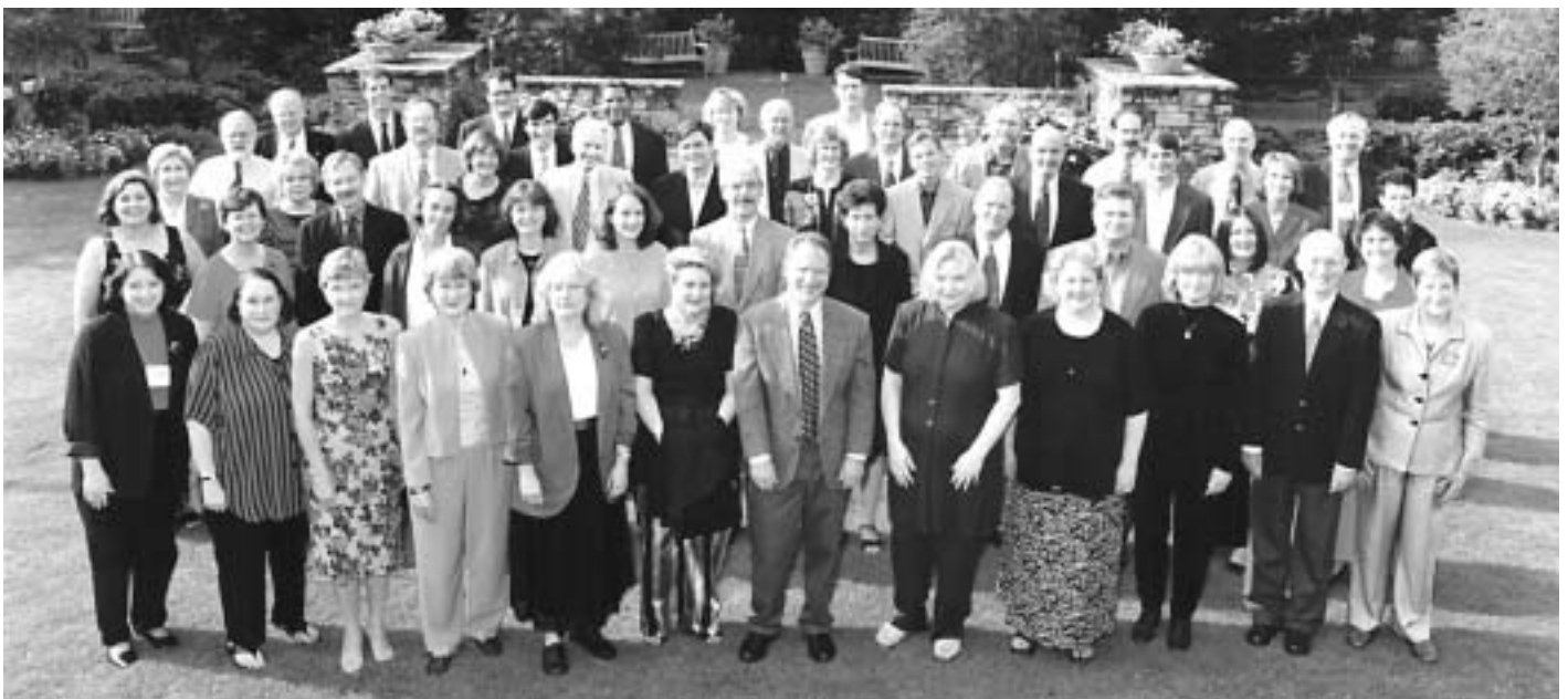
Frye Institute participants, June 2002.

During the first week, presidents, provosts, educational policy experts, and other administrative officers offered their views on the state of higher education today and the challenges confronting colleges and universities. In the second week, faculty, researchers, financial officers, library and information technology leaders, and training specialists addressed such issues as intellectual property and copyright, technological advances in