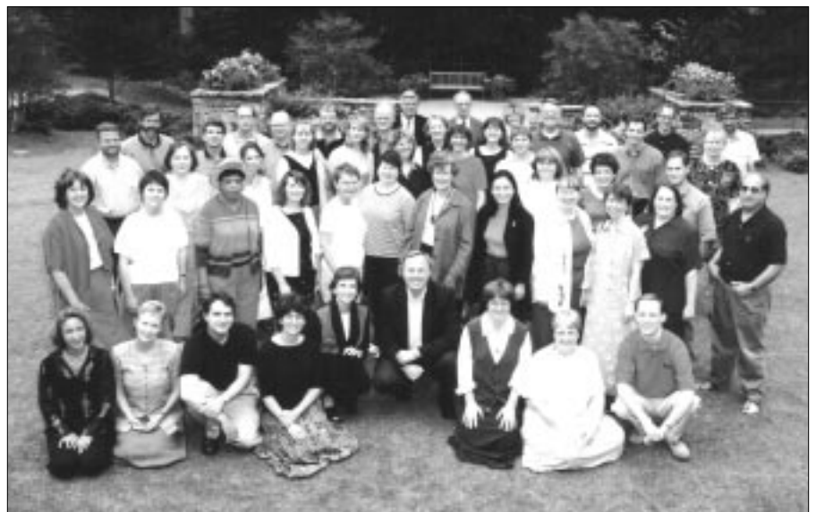
Frye Institute participants, June 2000

The participants came from community colleges, liberal arts colleges, and comprehensive and research universities. Without exception, they rated the Institute as uniformly excellent. Following the Institute, the participants are engaged in a yearlong practicum project on their home campuses, and they continue to communicate with one another through a listserv.