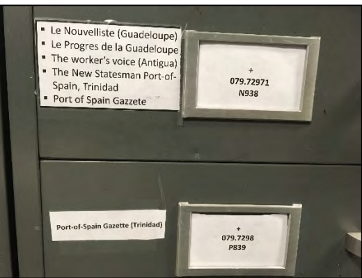
Latin American and Caribbean Collections Library at UF, microfilm cabinets for access copies of microfilm. Photograph taken 30 March 2018.