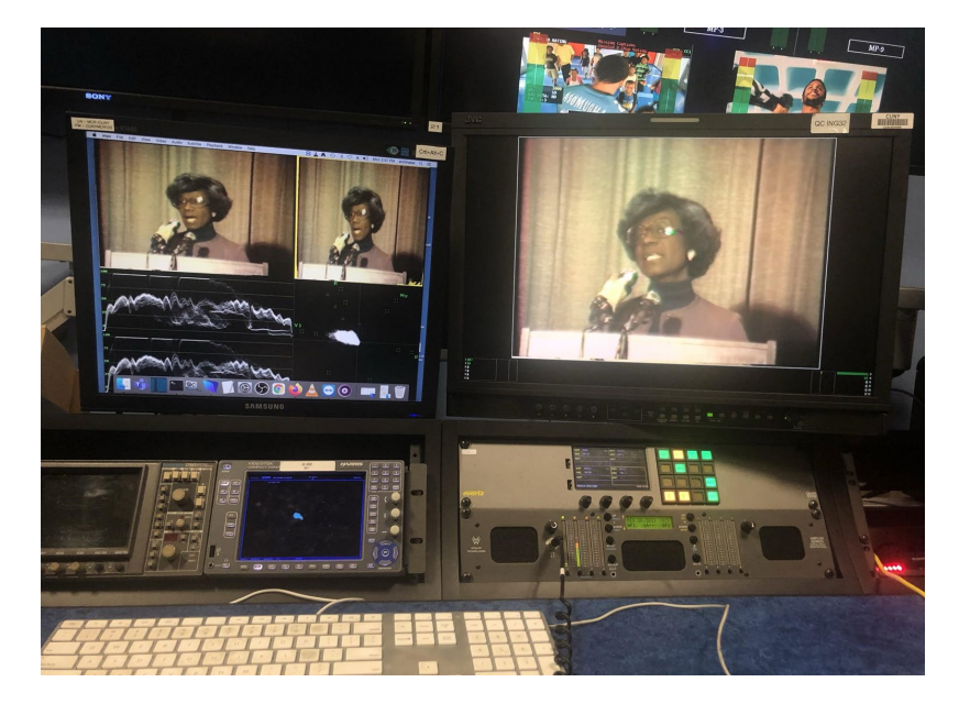
Content of "Shirley Chisholm" tape revealed from digitization.

CUNY TV Engineer, Flip, is posing in front of the videotape digitization rack in the station's master control room.