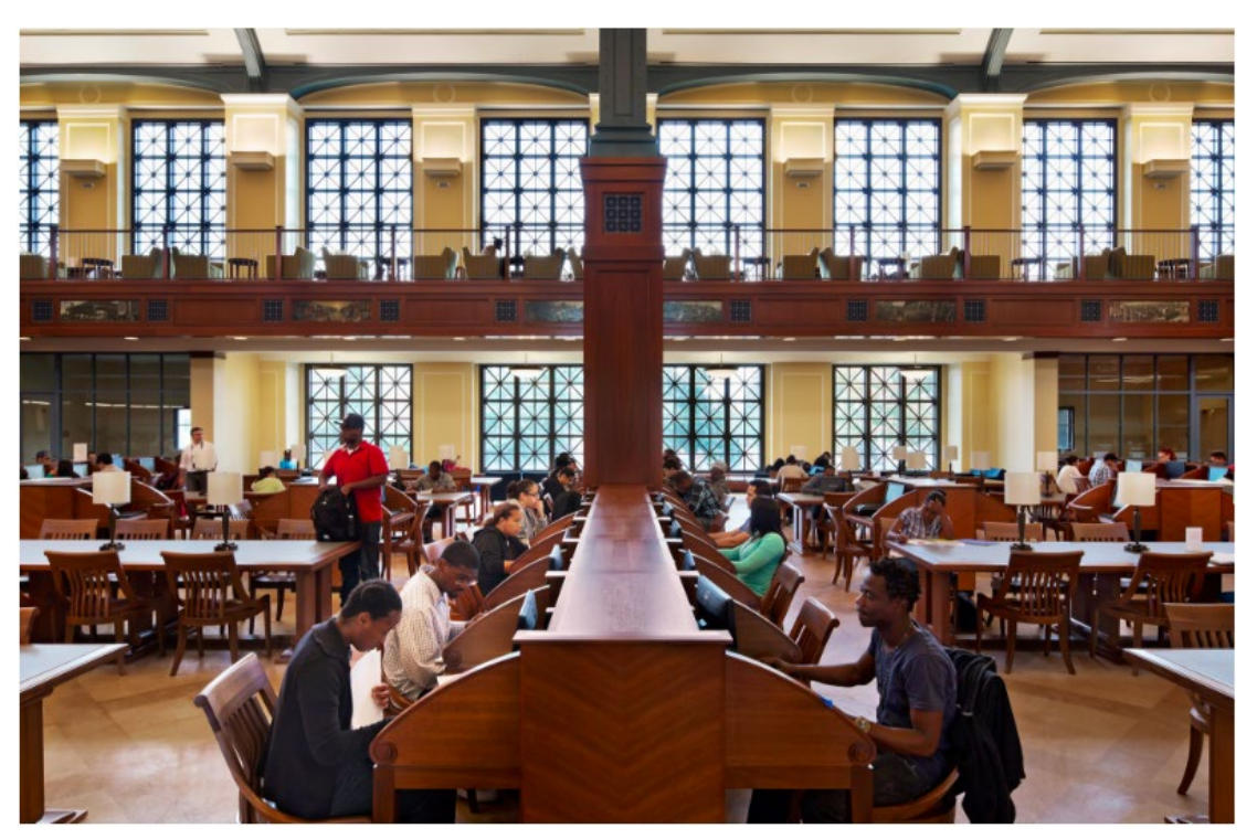
Bronx Community College Library. Photo by Peter Aaron. <u>https://cbbld.com/project/bronx-community-college-north-hall-and-library/</u>.