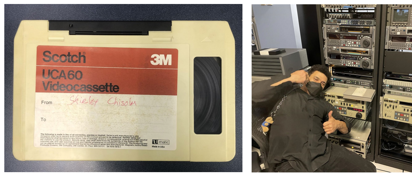
An unseen tape from Medgar Evers College Archives.

A campus-wide, shared-resources model for tape preservation