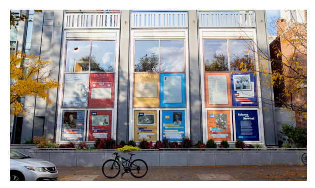
FIGURE 6: Image of Science and Survival, exhibition display.

could fit within the 12 windows and allows this haunting story to live on long after the panels are deinstalled in spring 2023. The video also gives the Institute a chance to share the exhibition with important individuals who cannot attend in person, including members of the Bredig family who reside out of state. In honor of Holocaust Remembrance Day in January 2023, the video was posted to Vimeo and circulated to the Institute's entire electronic newsletter readership. The project team will continue to