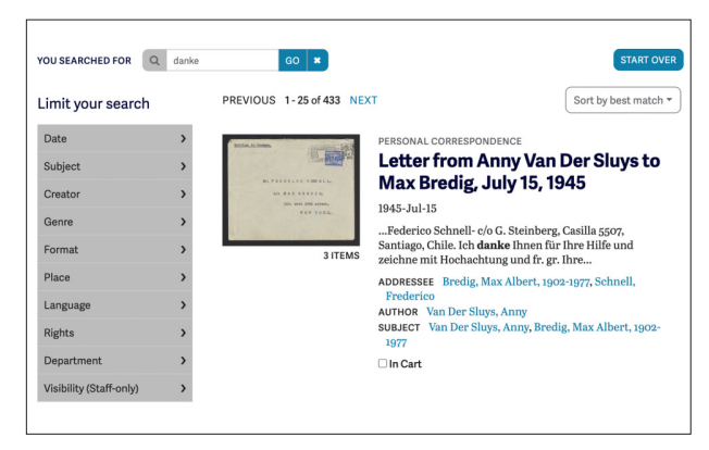
FIGURE 4: Digital Collections search results interface. Results depict a German-language text search.

The Digital Collections librarian then investigated transcription and translation projects conducted by peer institutions. The intention of the investigation was to explore where and how other institutions had incorporated transcription or translation information on their webpages. This peer analysis revealed that other institutions either did not format their transcriptions to match the original document, or they used an advanced encoding schema, such as TEI. The peer examples also rarely included both a transcription and translation, but only one or the other. Despite the realization that our endeavor was somewhat unique, these peer examples provided ample inspiration and direction for the design of new features on the Science History Institute's Digital Collections site.