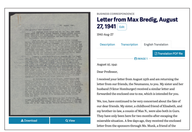
FIGURE 2: Digital Collections updated record interface with Transcription and Translation tabs. English Translation is displayed.

The team's plan was to develop the existing application interface and build new features to accomplish three main objectives: first, to store transcription and translation data in the digital repository; second, to optimize navigation of the site to make the data easily locatable for users as