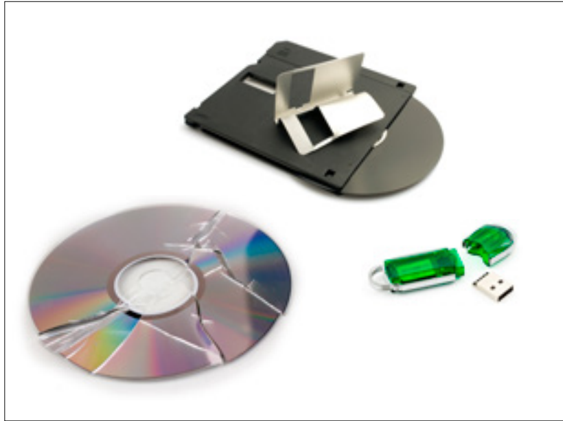
Fig.2: Digital media with physical damage: a CD, a USB drive, a 3.5" floppy disk.

the repository's agreement with the donor or dealer. Physical damage to media may also change the level of preservation and access that a repository can provide. Documenting the physical condition of the files in relation to other factors and making that information easily accessible will facilitate preservation planning. Information about physical condition may also be of interest to future researchers. Donors, dealers, and repositories should not assume that nothing of value can be recovered from digital media just because they may be decades old and battered looking.